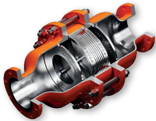
Flame & Detonation Arresters