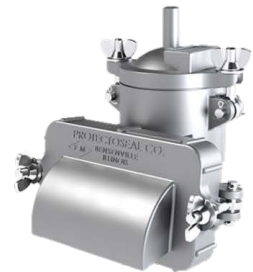
Combo Conservation Vents & Flame Arresters