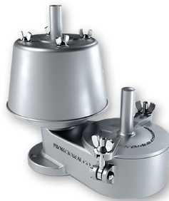
Pressure & Vacuum Conservation Vents