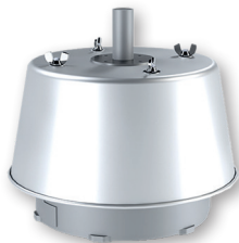
Emergency Relief Vents