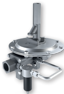
Tank Blanketing Valves